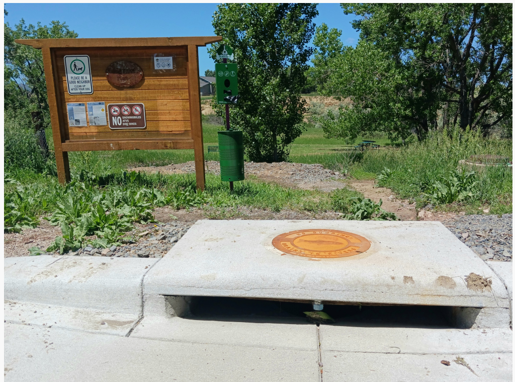
The new inlet, concrete work, and doggie clean-up station at the park entrance.

Subscribe to the HOA email list at www.SkyviewNorthHOA.org or SkyviewNorthHOA@gmail.com to sign up to volunteer and stay up to date on park projects.